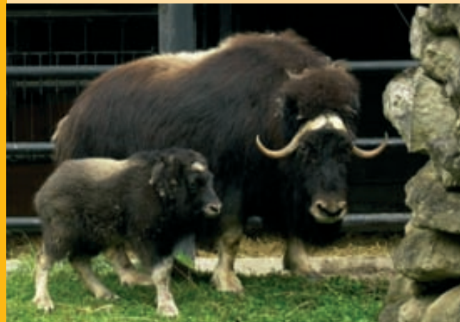
Northern Musk Ox