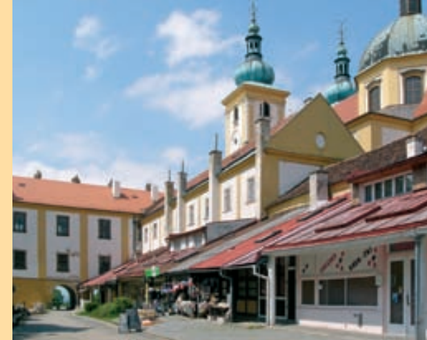
Sadové náměstí (Orchard Square)

is the work of a number of well-known Viennese, Transalpine, Moravian and even Olomouc artists. The church's architectural and artistic beauty places it among the most successful examples of the baroque style in Moravia. On the occasion of the visit of Pope John Paul II in the year 1995 the church was raised to the status of a "Basilica Minor". The preserved sections of a pilgrimage trail leading from the village of Chválkovice to Svatý Kopeček were recently restored. At the present time, the church is the home to not only pilgrimages and numerous masses, but also occasional concerts.