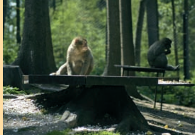
Japanese Macaques in the open exhibit

The present zoo has its origins in a small zoo corner in Smetanovy sady (Smetana Gardens) in Olomouc which consisted of several deer and roebuck, peacocks, pheasants and various smaller exotic birds. Increased interest in this project led to the idea of expanding the collection into zoological gardens. For this purpose land of the former monastery adjoining the well-known pilgrimage church on Svatý Kopeček (The Holy Hill) was chosen and in the year 1956 the zoological gardens were ceremonially opened. The first inhabitants of the new zoo included roebucks, deer, foxes, a racoon, porcupine and various species of birds. At the present time approximately 300 animal species are housed in numerous pavilions and outdoor exhibits, out of which 46 are included on European preservation pro-