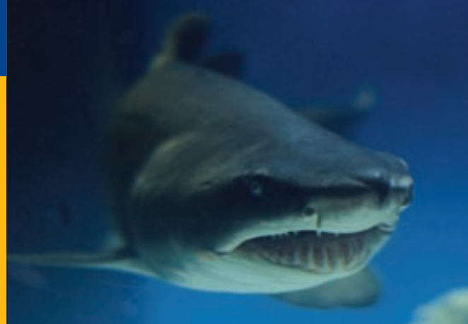
Black Finned Shark