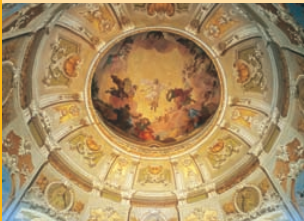
The Church of Blessed Virgin Mary – Interior