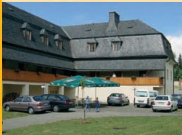
Restaurant – Hotel Fojtství

Tue – Sat 10:00 – 22:00, Sun 9:00 – 22:00