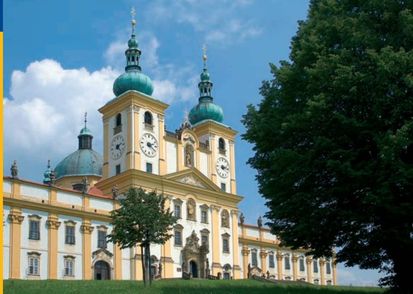
The Church of the Visitation to the Virgin Mary