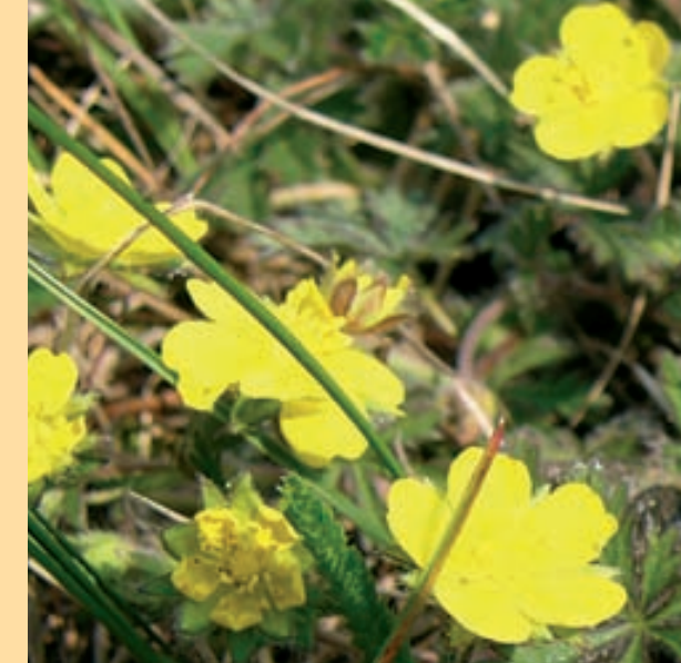
Bystřice Valley National Park